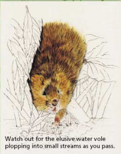
Watch out for the elusive water vole plopping into small streams as you pass.